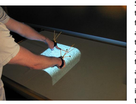
Figure 4 . Using 6-DOF trackers attached to the hands, a surface fold is performed by defining a fold axis via 2D touch input.

Example Interaction 2: Rapid Volumetric Selection This interaction technique, built on top of the same floating WIM interface, enables volumes of interest to be defined by touch input on several 2D slices through the volume data. The workflow is shown in Figure 3. As the user adjusts his location in the volume by using the slice indicated in green, a widget in the lower right corner is updated to display the 2D data slice through at this location. A persistent snapshot is saved by dragging out the slice from this widget. After a number of these are created, rapid volumetric selections are performed by placing several fingers on an individual slice and fitting a convex hull to them. The selection updates across all of the linked slices to include the portion of the volume outlined by this convex hull. In a vector of flow field, particle tracking is used to smartly extend the selection (e.g., extending along flow lines) throughout the volume.