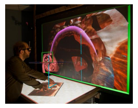
Figure 2 . A user specified generalized cylinder that follows the centerline curve of the ascending aorta.

input channel, natural support for collaboration [3], and a direct style of input that closely mimics how we interact with physical objects [5]. Unfortunately, using touch interfaces for more than simple tasks is often challenging; in particular, new methods are needed for using touch to interface with 3D content.